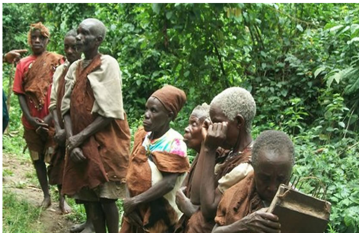
Figure 1: Forests serve as sites of aesthetic, recreational, and spiritual value in many cultural and societal contexts. Traditional ceremonies/worship/healing normally take place in forests

Medicinal purposes: The forests are a traditional pharmacy with herbs that can be extracted from leaves, tree bark, vines and roots as well. Animal-based remedies and specimens that can be extracted from the skins, fur, nails, feathers, live animals, eggs and others are also found in the forest. Furthermore, there are spiritual and/or traditional healing rituals that communities/traditional healers perform under the canopies of specific forest types and/or trees. For example, Bugoma CFR hosts a cultural site for Bunyoro kingdom.