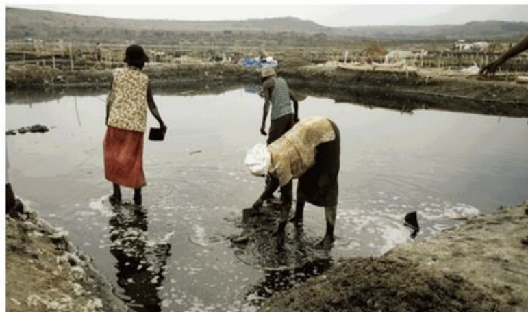
Some women mine salt in Lake Katwe, Kasere District.

The Africa Institute for Energy Governance (AFIEGO) has petitioned the Minister of Energy and Mineral Development, Mary Goretti Kitutu, calling for urgent protection of artisanal salt miners at Lake Katwe.