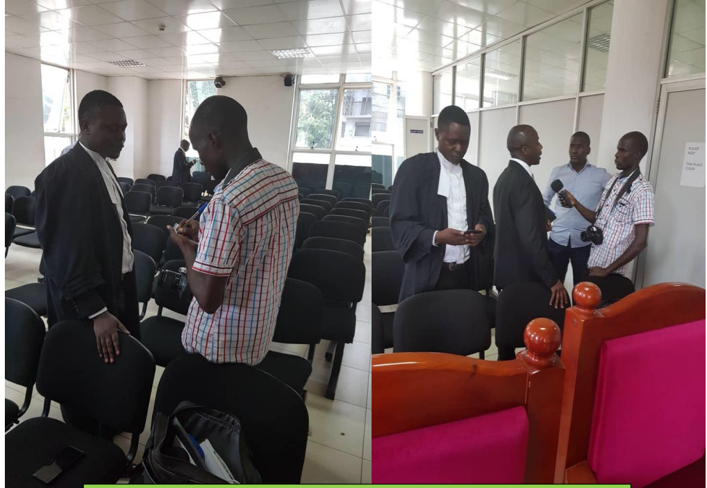
The lawyer and representatives of the youth in addition to CSOs after the case hearing and during media interviews at the Kampala High Court