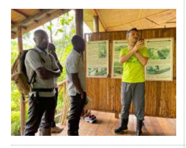
3. Beekeeping training for communities in Kikuube district. Bugoma forest supports beekeeping.

2. One of the researchers (R) after an interview with a research participant (L)