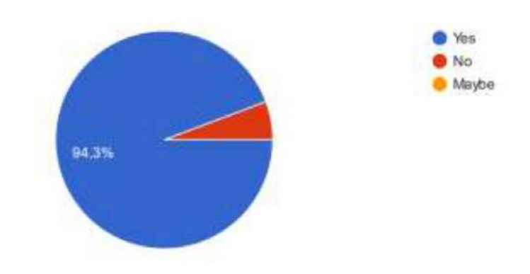
Figure 1: Tour operators' awareness of Bugoma forest

Through an online survey that was participated in by tour operators, this study established that Uganda tour operators are aware of the existence of Bugoma forest. 94.3% of the tour operators that participated in the study observed that they were aware of the existence of Bugoma forest as can be seen under Figure 1. Further, 94.1% said that they would sell Bugoma forest as a tourism destination as can be seen in Figure 2.