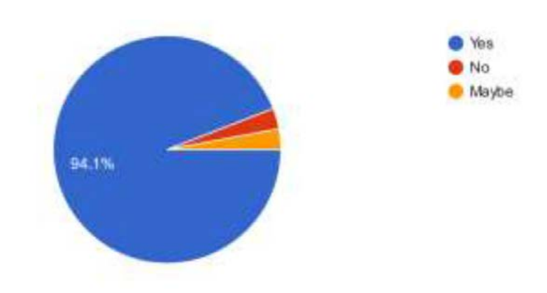
Figure 2: Tour operators' willingness to sell Bugoma as a tourism destination